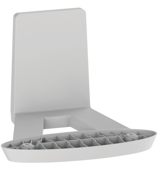
Wall mount cover