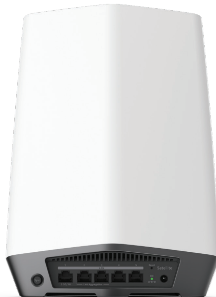
Orbi Pro WiFi 6 Satellite (SXS80)