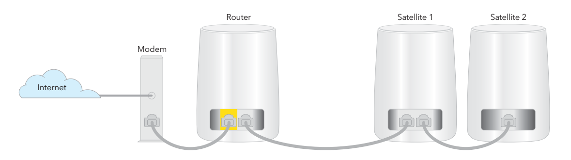
Figure 4. Daisy chain topology: Satellite 1 connected to router and satellite 2 connected to satellite 1

The following figure shows another way to connect your Orbi satellites to your Orbi router using a daisy chain topology to create an Ethernet backhaul connection.