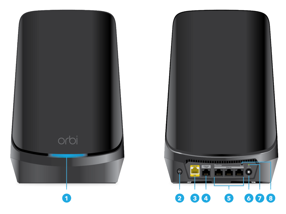
Figure 1. Orbi router front and back views

The following figures shows the Orbi router hardware features.