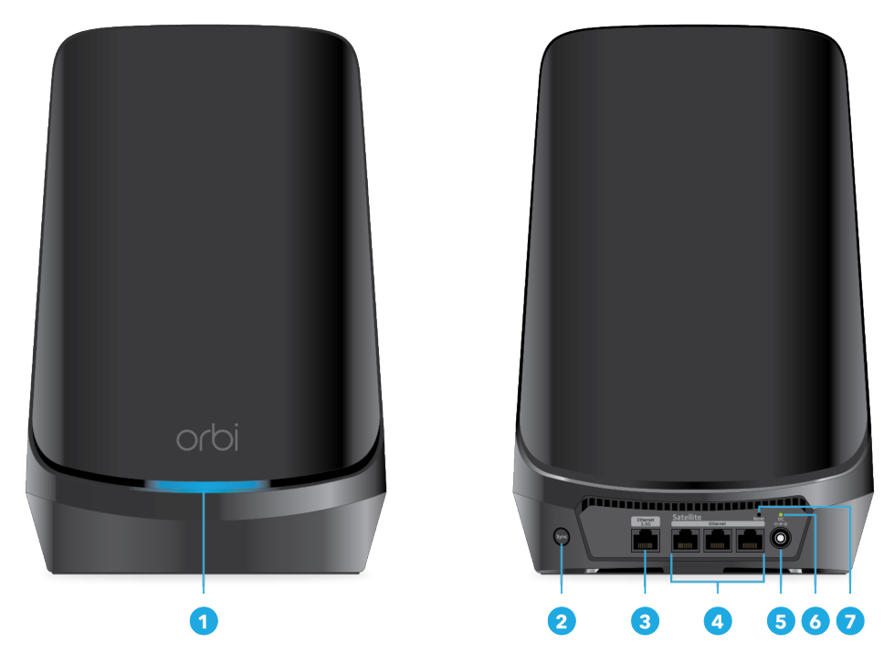
Figure 2. Orbi satellite front and back views

The following figures shows the Orbi satellite hardware features.