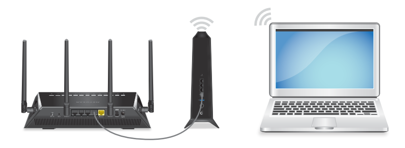
Figure 4. Extender in access point mode

You can use the extender as a WiFi access point, which creates a new WiFi hotspot by using a wired Ethernet connection.