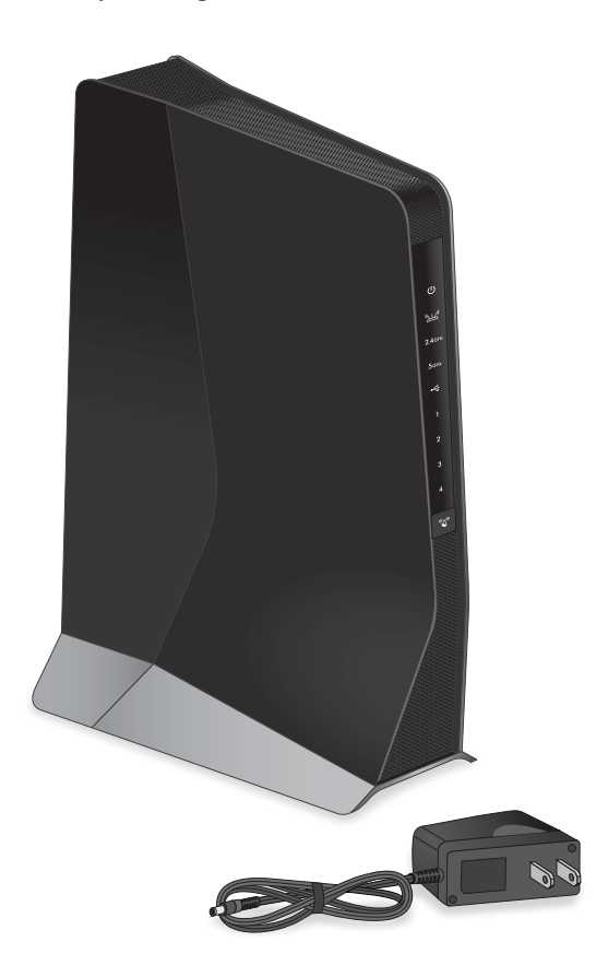
Figure 1. Extender package contents

Your package contains an extender and power adapter.