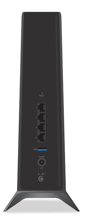
Figure 3. Back panel

The back panel of the extender provides ports, buttons, and a DC power connector.