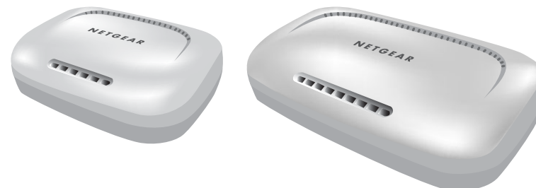
Fast Ethernet Switch FS605 v2/FS608 v2

The NETGEAR® 5/8-Port Fast Ethernet Switch Model FS605 v2/FS608 v2 provides you with a low-cost, reliable, high-performance switch to connect up to five or eight different Ethernet-enabled devices (such as computers, file servers, print servers, printers, routers and hubs).