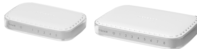
Fast Ethernet Switch FS605 v3/FS608 v3

The NETGEAR® 5/8-Port Fast Ethernet Switch Model FS605 v3/FS608 v3 provides you with a low-cost, reliable, high-performance switch to connect up to five or eight different Ethernet-enabled devices (such as computers, file servers, print servers, printers, routers and hubs).