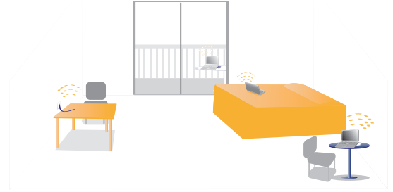
Multi user mode allows multiple users to share one internet connection.