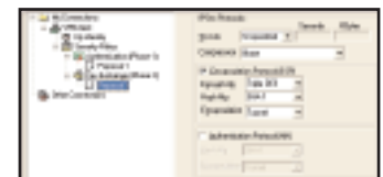
Data encryption settings