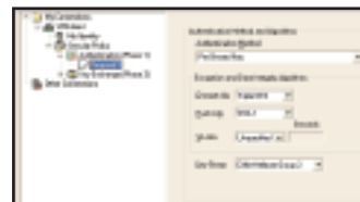
Authentication encryption settings