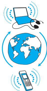
Skype-to-Skype These over-the-Internet calls are always free, anywhere in the world