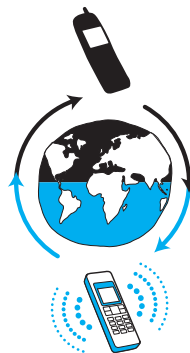
SkypeIn/SkypeOut Used to make or receive regular phone calls over the Internet at pennies-per-minute