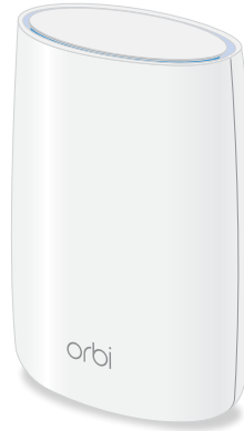
Orbi satellite (Model RBS50v2)