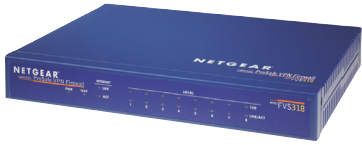
15-user Office VPN Router

Want the utmost in network security for your office? NETGEAR's FVS318 ProSafe VPN Firewall provides business-class protection at an affordable price. This completely equipped, broadband-capable firewall router offers a stateful packet inspection (SPI) firewall, denial-of-service (DoS) protection and intrusion detection, URL key word and content filtering, logging, reporting, and real-time alerts. VPNC certified, it initiates up to 8 IPsec VPN tunnels simultaneously, reducing your operating costs and maximizing the security of your network. With 8 auto-sensing, Auto Uplink™ switched LAN ports and Network Address Translation (NAT) routing, up to 253 users can access your broadband connection at the same time.