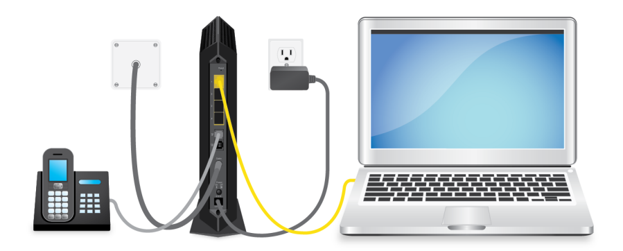
Figure 5. Connect your cable modem to a computer