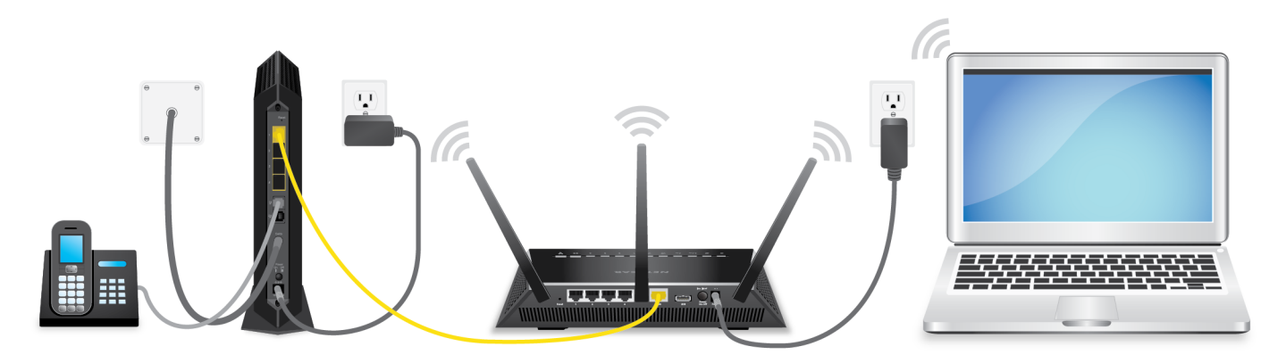
Figure 6. Connect your cable modem to a router

Note To install your cable modem, use Ethernet port 1. Your cable modem comes with plugs that cover Ethernet ports 2, 3 and 4. These ports can be used to connect a router that supports Ethernet port aggregation. Your cable modem might not support Ethernet port aggregation the first time that you set it up. Check netgear.com/support to find out if your cable modem supports Ethernet port aggregation yet.