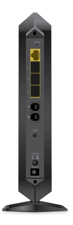
Figure 3. Rear panel

The connections and button on the rear panel are shown in the following figure.