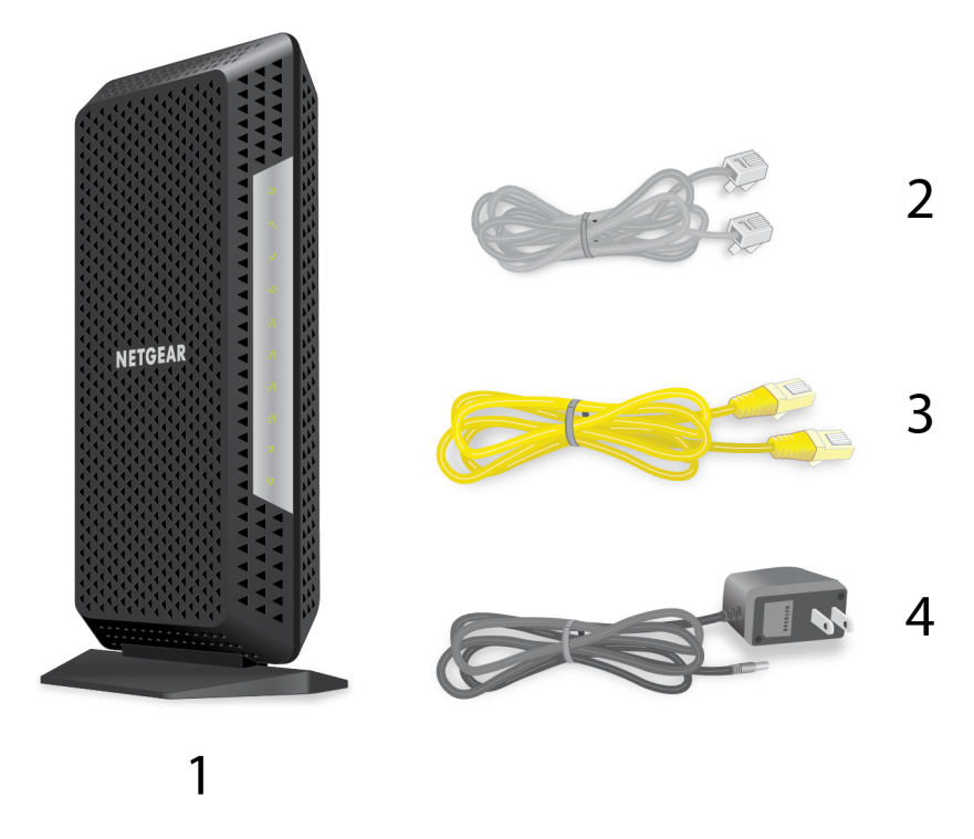
Figure 1. Package contents

Your package contains the following items.