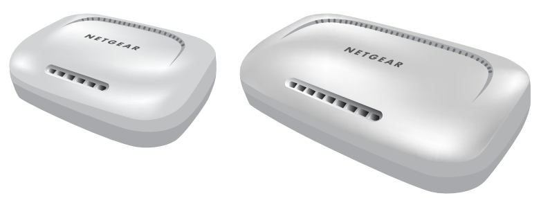
Fast Ethernet Switch FS605 v2/FS608 v2

The NETGEAR® 5/8-Port Fast Ethernet Switch Model FS605 v2/FS608 v2 provides you with a low-cost, reliable, high-performance switch to connect up to five or eight different Ethernet-enabled devices (such as computers, file servers, print servers, printers, routers and hubs).